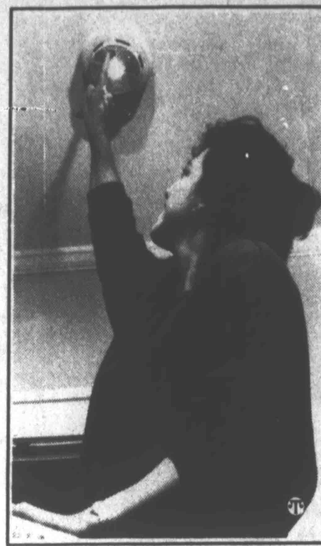
The unit's horn sounds to let you know the detector is operational.

When homeowners surveyed were specifically asked to test their smoke detectors, it was found that nearly one in ten were inoperable. That means millions of American families are greatly increasing their risk of death and injury due to a home fire.