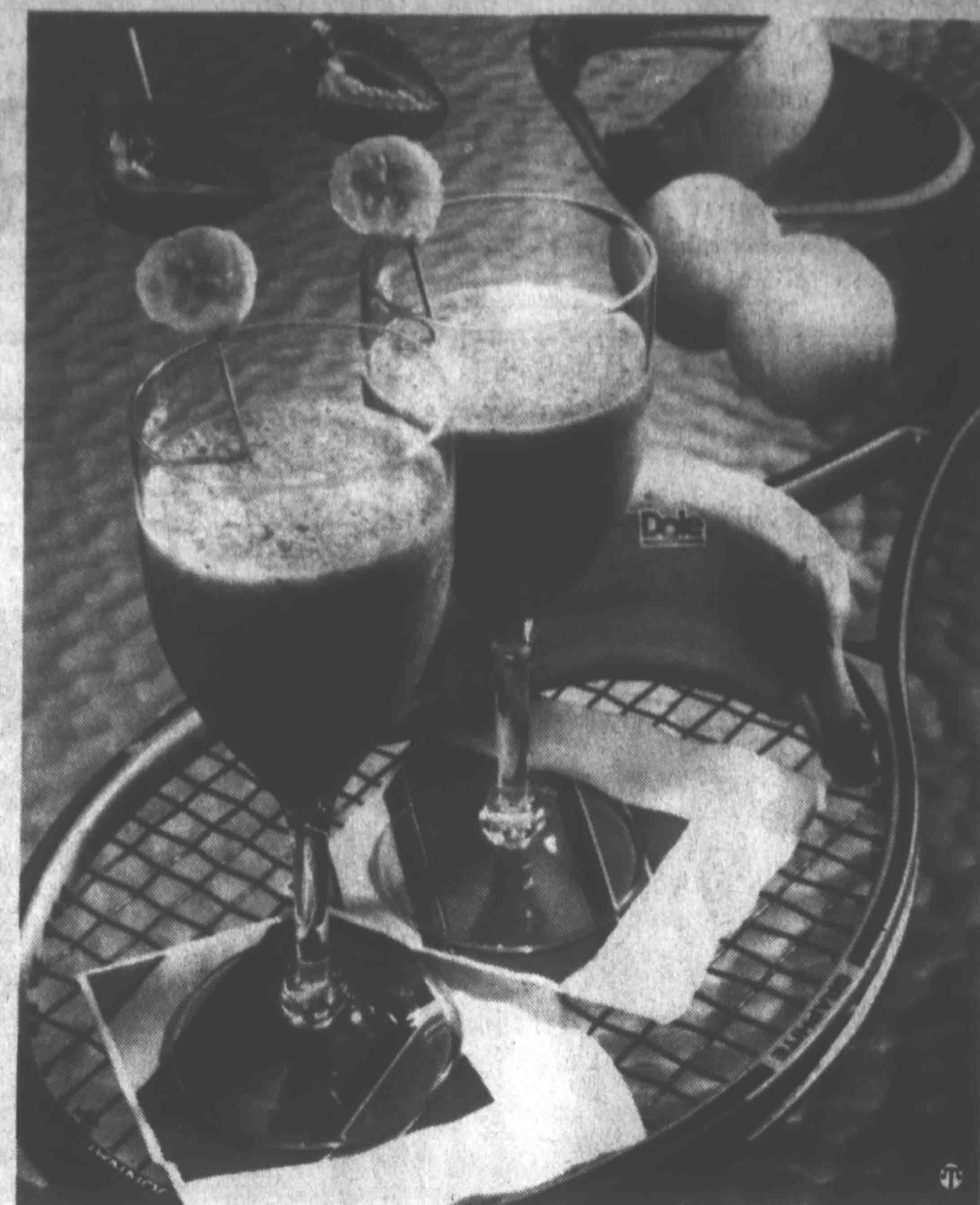
FROSTY FRUIT DRINK

New Office in Dyersburg 107 N. Main 287-1478