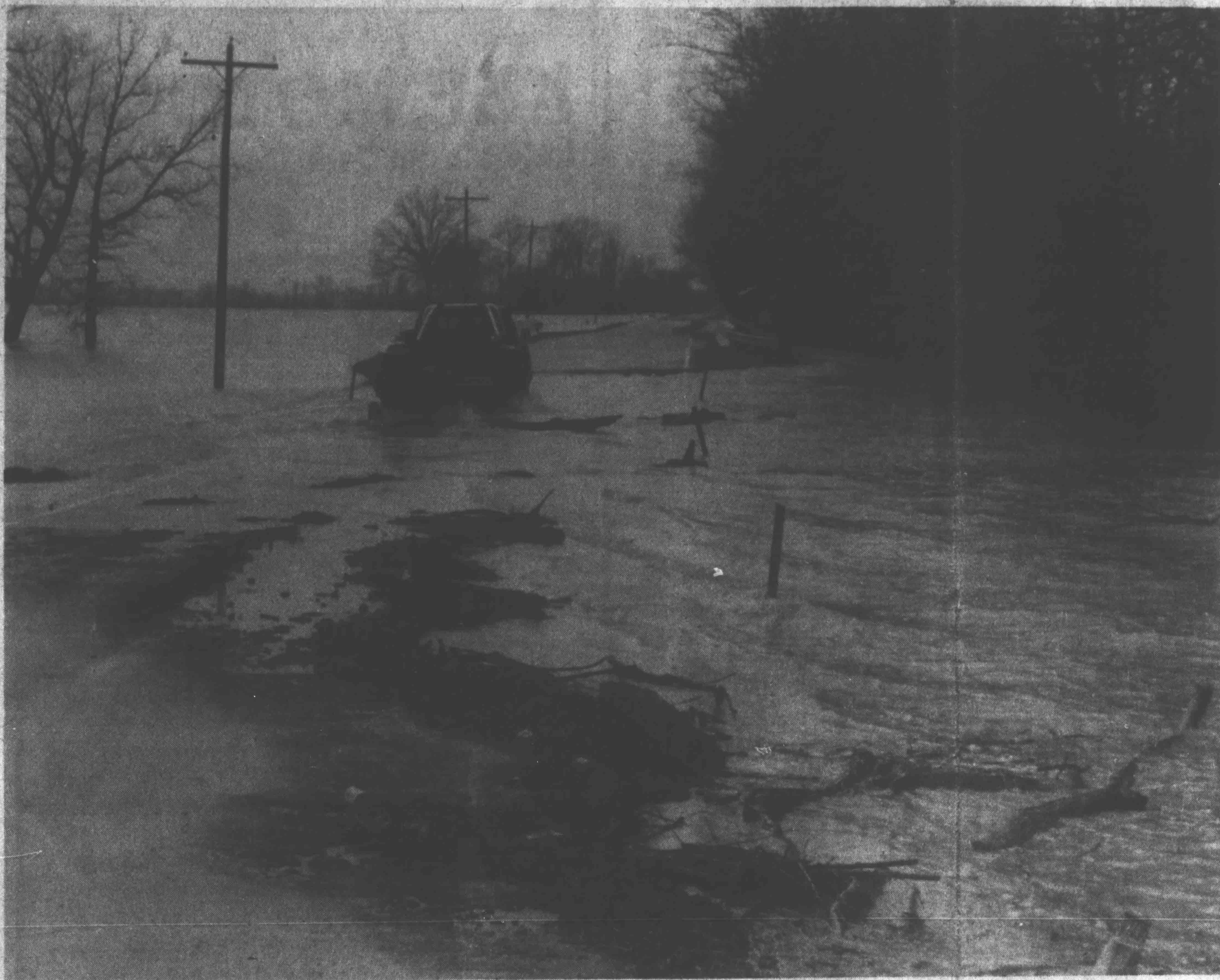
HALL'S POINT BOTTOM , seen from State Hwy. 88 west of Halls, looks like this after more than 15 inches of rain measured in the county since Dec. 13th, putting the Forked Deer and Obion Rivers out of their banks. The Mississippi River is above flood stage on the gauge at Caruthersville, Mo.