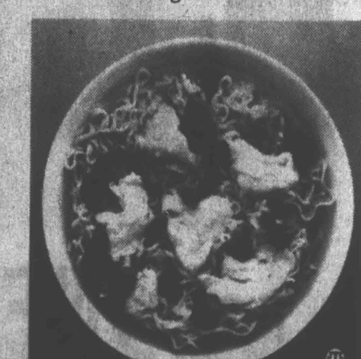
Bacon and eggs combine to make a zesty-flavored meal with the help

Ever have breakfast for dinner? A hearty soup featuring some breakfast favorites may be "souper" actly the treat for hard-working folk who "bring home the bacon."