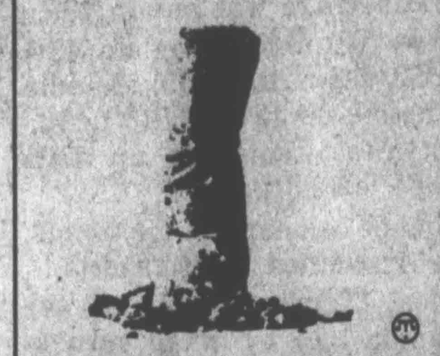
This could be your year to "kick butts"—cigarette butts, that is.

Having doubts about quitting? For information on quitting smoking, call 1-800-4-CANCER.